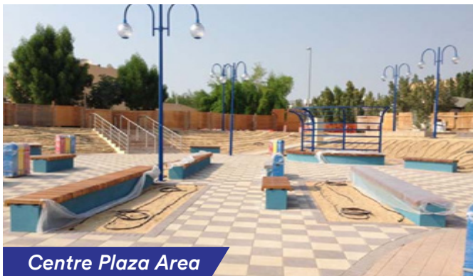
Centre Plaza Area