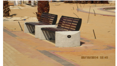
Al Mankhool Park

Timber structures serve to satisfy functional requirements such as decking, shade and seating whilst providing your landscape with an aesthetic appeal.