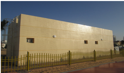
Al Mankhool Park Mankhool

We are a G+1 Dubai Municipality approved contractor having 10 years of successful service history delivering various projects in the government, semi government, commercial and private sectors.