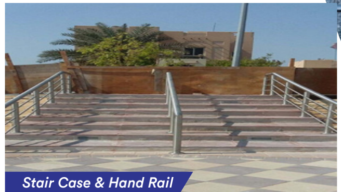
Stair Case & Hand Rail