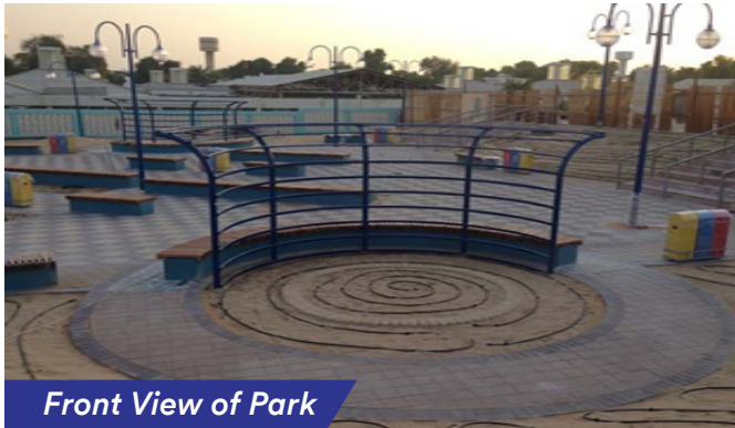
Front View of Park