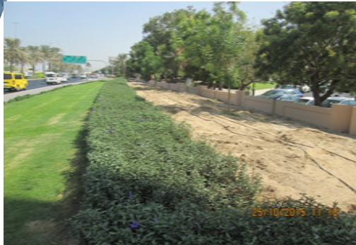
Al barsha- Dubai Hospital