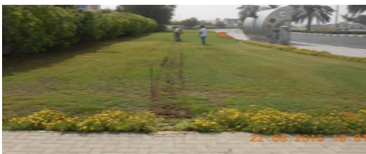
Jewel of Creek