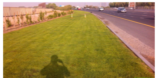
ETA Dewa-Ras Al Khour