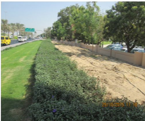
Time Electro- Zabeel

An automated irrigation system refers to the operation of the system with no or just a minimum of manual intervention beside the surveillance. Almost every system (drip, sprinkler, surface) can be automated with help of timers, sensors or computers or mechanical appliances. It makes the irrigation process more efficient and workers can concentrate on other important farming tasks.