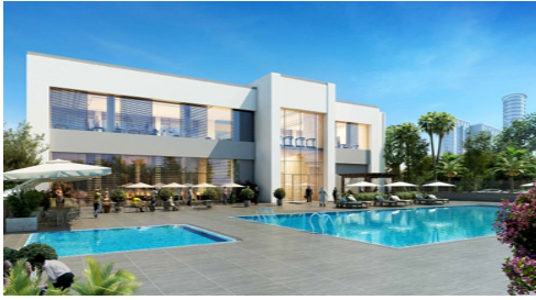
Warsan Club House International City