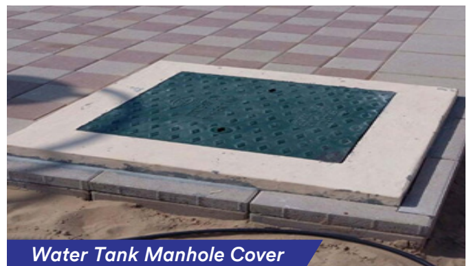
Water Tank Manhole Cover